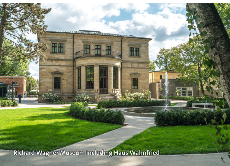
Richard Wagner Museum including Haus Wahnfried

Every year in summer Bayreuth becomes one of the most important culture metropolises, attracting people from all over the world. Through hosting the first festival of this kind, Bayreuth has set standards: today, as in 1876, there is a special charm to experiencing the Richard Wagner creations in their place of origin. Visit the festival theatre within the scope of a guided tour and discover the secrets of the exceptional acoustics! In the Richard Wagner museum you can dive into the time of Richard Wagner himself and the eventful history of the Bayreuth Festivals. The Walk of Wagner invites you to stroll along numerous original sites ranging from the Villa Wahnfried to the festival theatre.